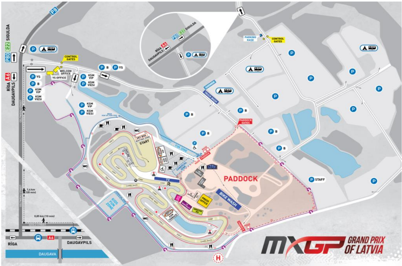
Map of the track